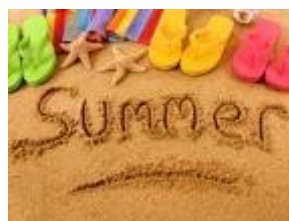
2 - Summer Role Play Resources

Year 5 had a fantastic time taking part in Bikeability this term and showed great enthusiasm throughout the sessions. They developed their cycling skills, road awareness, and confidence, learning how to ride safely in real traffic conditions. The instructors were very impressed with their focus and positive attitudes each day. We are incredibly proud to share that every pupil successfully passed Level 2, demonstrating excellent control, teamwork, and responsibility on the roads. Well done to all of Year 5 for their hard work and determination—what an amazing achievement!