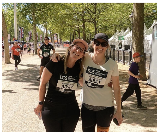
1 - Mini-Marathon - It wasn't just the children who had fun!